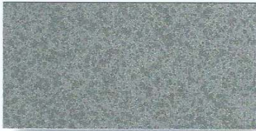
Zincalume (08) SR = 0.27 TE = 0.29 SRI = .65

Borga Standard SMP Colors are formulated with a proprietary Silicone Modified Polyester paint system and premium ceramic IR Reflective pigmentation. Supplied by Continental Coatings Inc., these SMP colors are designed for outstanding weatherability, U.V. resistance and extended service life. Exceptional scratch and scuff resistance also provide fabrication, transit, handling, and installation performance advantages. Applied and high temperature baked over polyurethane primed hot-dipped galvanized or zinc-aluminum coated high strength steel substrate, this is the product of choice for many commercial, residential, and specialty building applications.